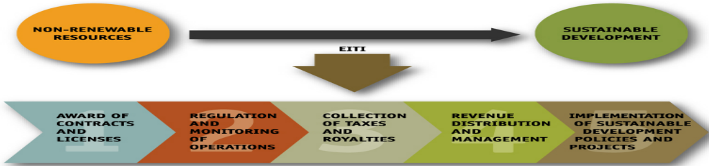
Figure 2: The Extractive Industries Value Chain

11. This puts an even higher obligation on ensuring that collected mineral revenues generate high social returns. The Extractive Industries Value Chain model (see Figure 2) used by the World Bank to assess the contribution of extractive industries to sustainable development distinguishes five